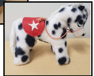
Douglas Toy Company plush horse, Keene, NH, c.1970s