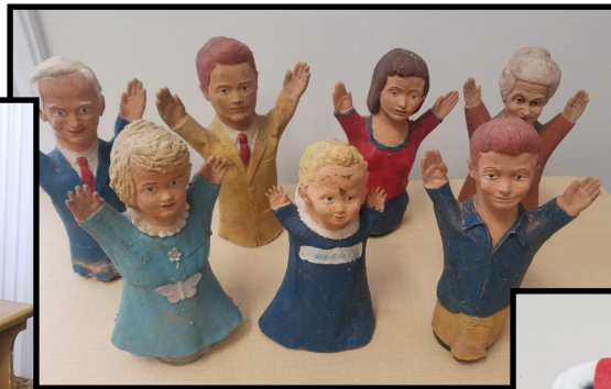
Red Shed Rubber Toys puppet family, Peterborough, NH, 1950s