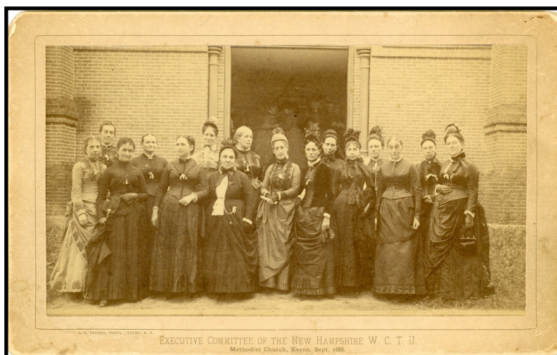
Executive Committee of the New Hampshire Women's Christian Temperance Union in Keene, NH, September 1888.

There are several ways you can help us meet our ambitious goals for Giving Tuesday. We will need a social media squad to help us get our message out. We are looking for people to share stories about ways in which their involvement with the Historical Society of Cheshire County has enriched their lives. And we hope to receive commitments for matching gifts in advance of Giving Tuesday. If you are interested in helping in any of these ways, please contact: devdir@hscn.org .