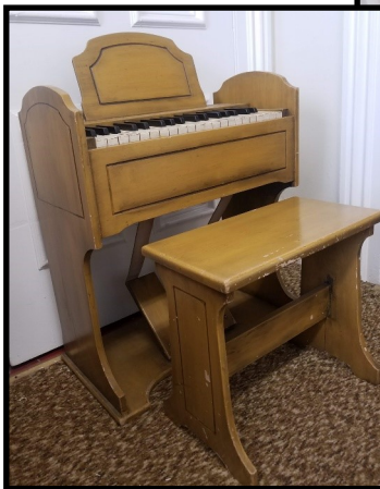
Estey Organ Company child's reed organ, Brattleboro, VT, early 20 th century

The Historical Society will host several toy related events and presentations in conjunction with the exhibit. Please visit the exhibit and take a trip back into your childhood.