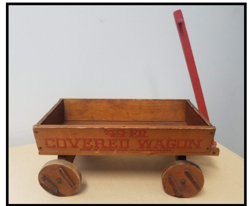
S. A. Smith Company toy wagon, Brattleboro, VT, 19 th century

In 1952 the Kenwood Blankets Company of Peterborough developed a display for an Easter trade show in New York City. The company decided to prepare a toy-land themed booth, complementing its line of bedding by using scraps of blankets to produce small stuffed sheep for the display. The toy props stole the show. The sheep were priced at $50 to deter sales, but they sold anyway. As a result, the company soon formed KenToys Company to make and sell stuffed toys to a national market.