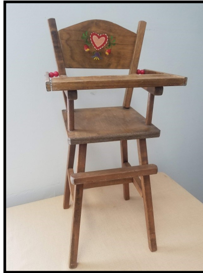
Whitney Brothers high chair, Marlborough, NH, mid-20th century