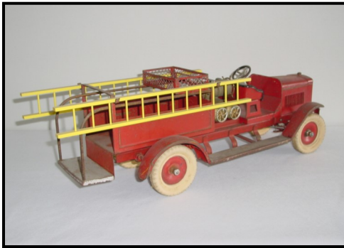
Kingsbury Toy Company, Keene, NH, fire engine, early 20th century