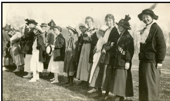
Participants in the Women's Track Meet in Keene, New Hampshire, May 11, 1916

As you probably know, Giving Tuesday is a movement for people to give something back to the causes that they believe in. It comes right after the big shopping days of Black Friday and Cyber Monday – which will be December 3rd this year.