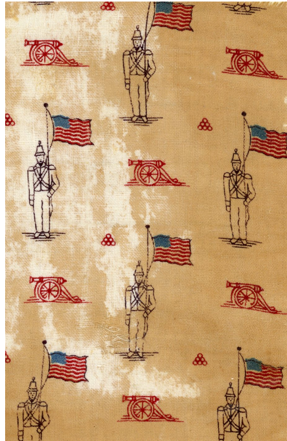
A sample of patriotic calico used by the Cheshire County Soldiers Aid Society to make hospital supplies for NH Civil War soldiers

The Cheshire County Society sent these items to the U.S. Sanitary Commission on June 7, 1863