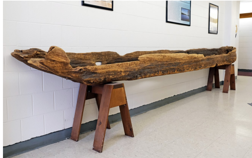
Dugout Canoe recovered from Laurel Lake, Fitzwilliam