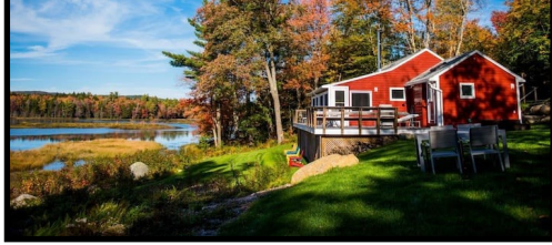
The Mended Oar Outpost, Chandler Meadow, Stoddard