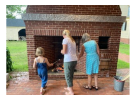
Roasting marshmallows at the hearth.