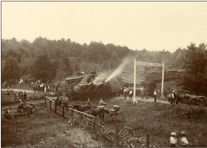
Photo of the famed hog train wreck at Pemberton Crossing, July 1897